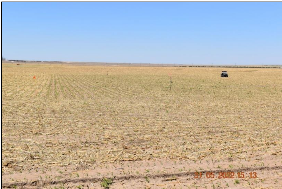
Plate 10. Installed soil moisture sensors within tillage plots of pivot-irrigated field planted to corn in Dallam County, May 2022.