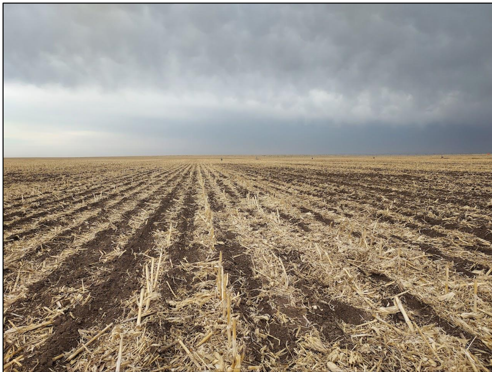
Plate 9. Adjacent strip-till (left side) and conventional-till (right side) treatments in a pivot-irrigated field in Dallam County, May 2023.