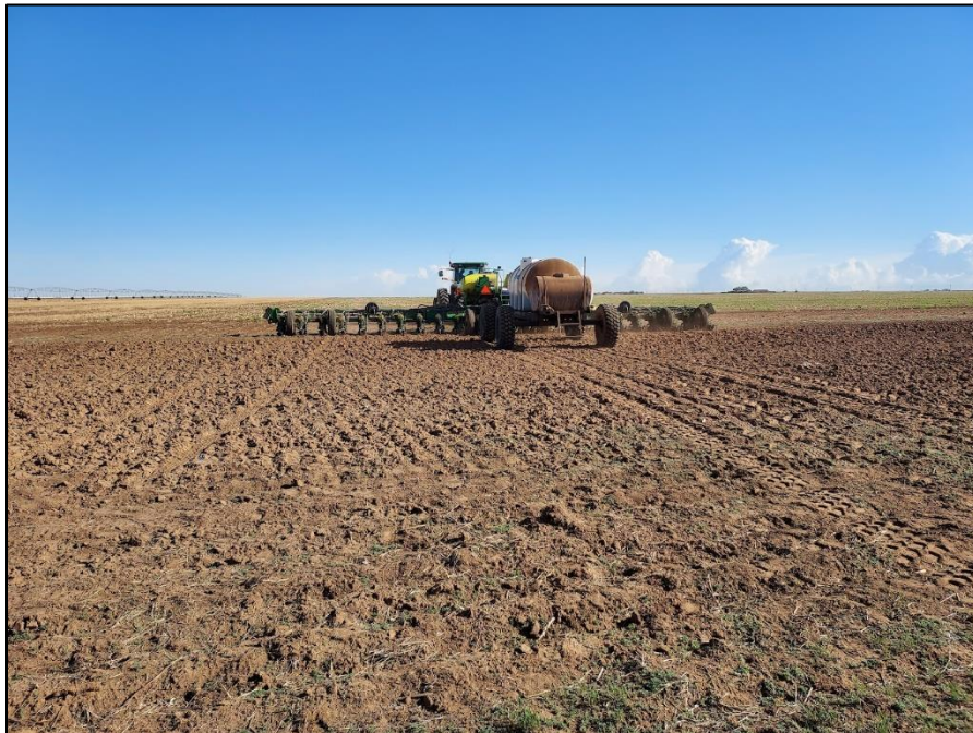
Plate 6. 24-row planter used to establish 8-row plots in RACE trial, Hartley County, May 2023.