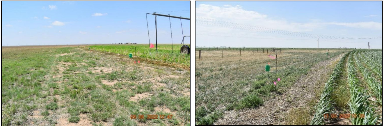
Plates 4 & 5. Adult moth trapping sites for corn at two locations in Sherman County, 2022.

We are fast approaching a new season of adult moth trapping near corn fields (Bt and non-Bt). As soon as the weather permits, traps will be set up and effort will be made to collect weekly moth counts in Moore and Sherman counties. This information helps growers, consultants, and others to keep abreast of moth flights, egg lay potential and likelihood of reaching economic thresholds of worm pressure from four, tracked species. These include the Western Bean Cutworm, Southwestern Corn Borer, Corn Ear Worm, and Fall Army Worm. Plan is to install and monitor 16 bucket traps, four at each of two locations in Moore County and at two locations in Sherman County as was done in 2022 (plates 4 & 5). Collected data is updated to a table format and distributed more immediately to folks via a Remind text. If you're interested in being added to the list of recipients, let me know.