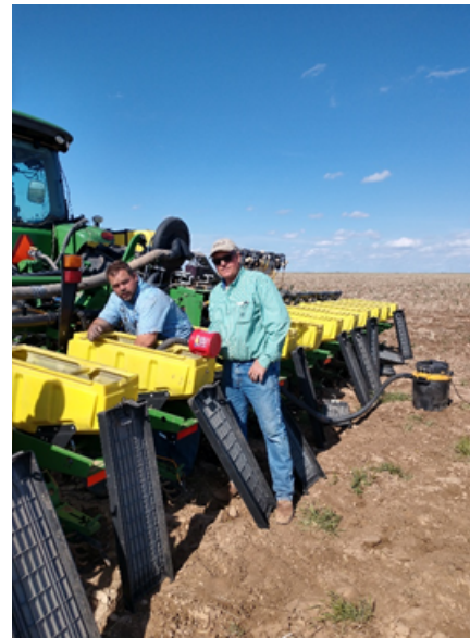
Cleaning and reloading planter units on May 24th, 2021 for a dryland, Replicated Agronomic Cotton Evaluation (RACE) trial in Moore county. Study site is in a strip till system and had good profile moisture at planting.