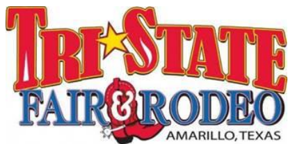
EXHIBIT AT THE TRI-STATE FAIR – sewing, baking, candy making, crafts, jewelry, paintings, drawings, photography, recordbooks, etc.