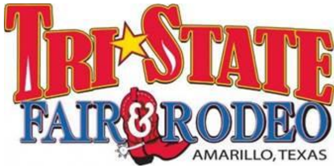
EXHIBIT AT THE TRI-STATE FAIR – sewing, baking, candy making, crafts, jewelry, paintings, drawings, photography, recordbooks, etc.